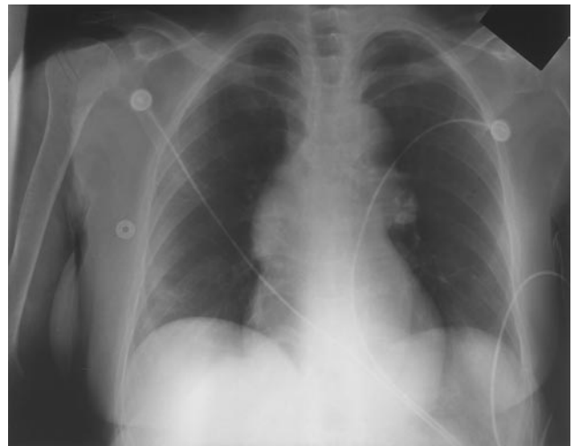
Figure 1. Chest x-ray demonstrates a widened superior mediastinum.

The aggressiveness in screening for aortic dissection in patients meeting thrombolytic therapy criteria for myocardial infarction has been debated. 4 The incidence of myocardial infarction far exceeds that of aortic dissection, and most feel it would be a disservice to delay thrombolytic therapy for a large number of patients who could benefit in order to protect the minority of those with aortic dissection.